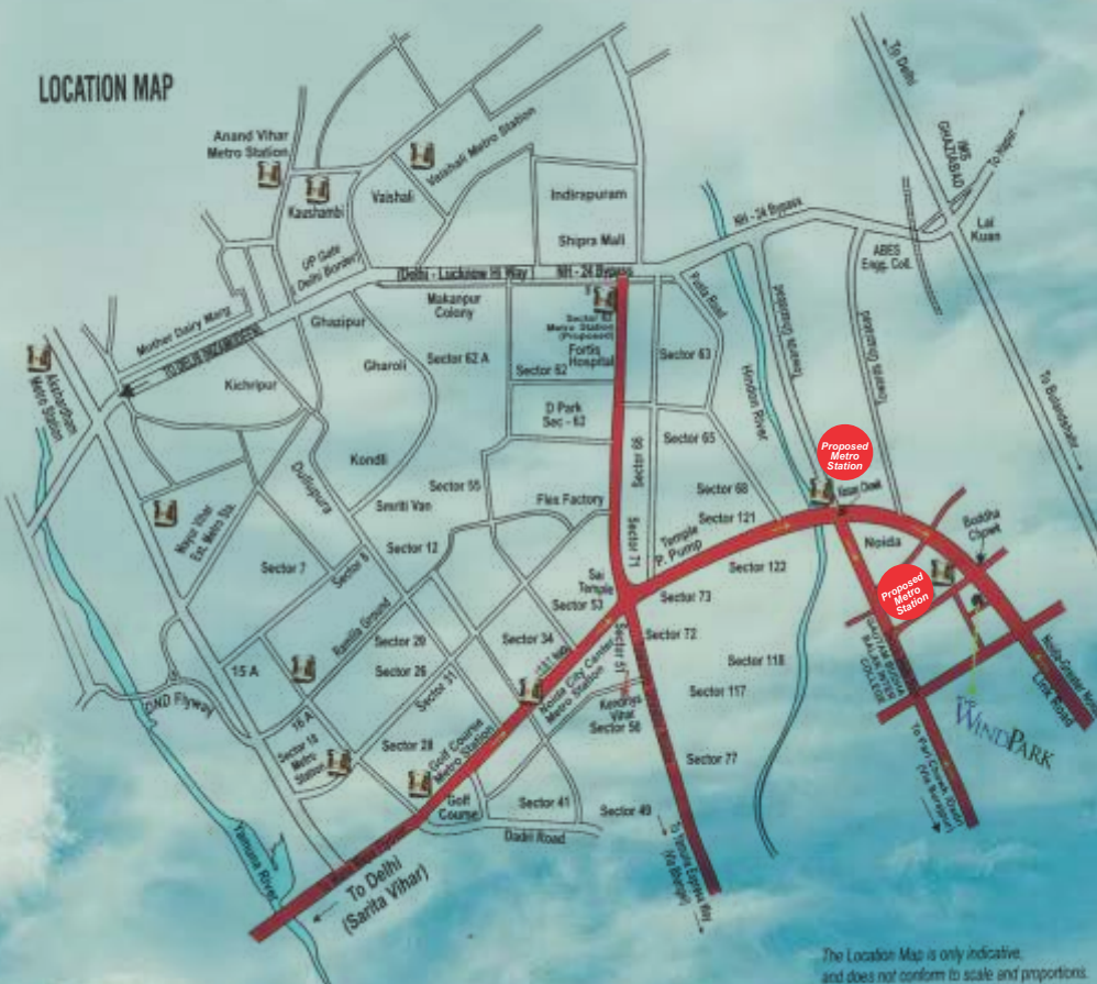
The Location Map is only indicative and does not conform to scale and proportions.